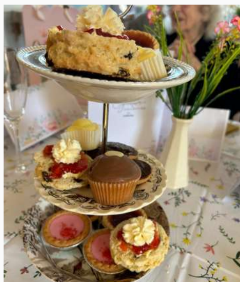
MOTHER'S DAY - PAGE 3

And don't forget—our full gallery of event photos is available online for you to browse anytime at www.saintdavidscare.com/gallery or on our new Facebook page! Simply search St David's Residential Home